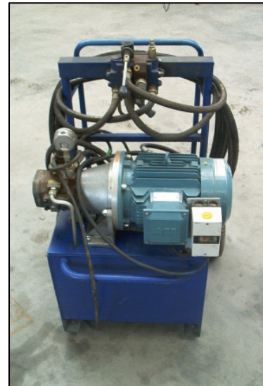
Hydraulic power unit